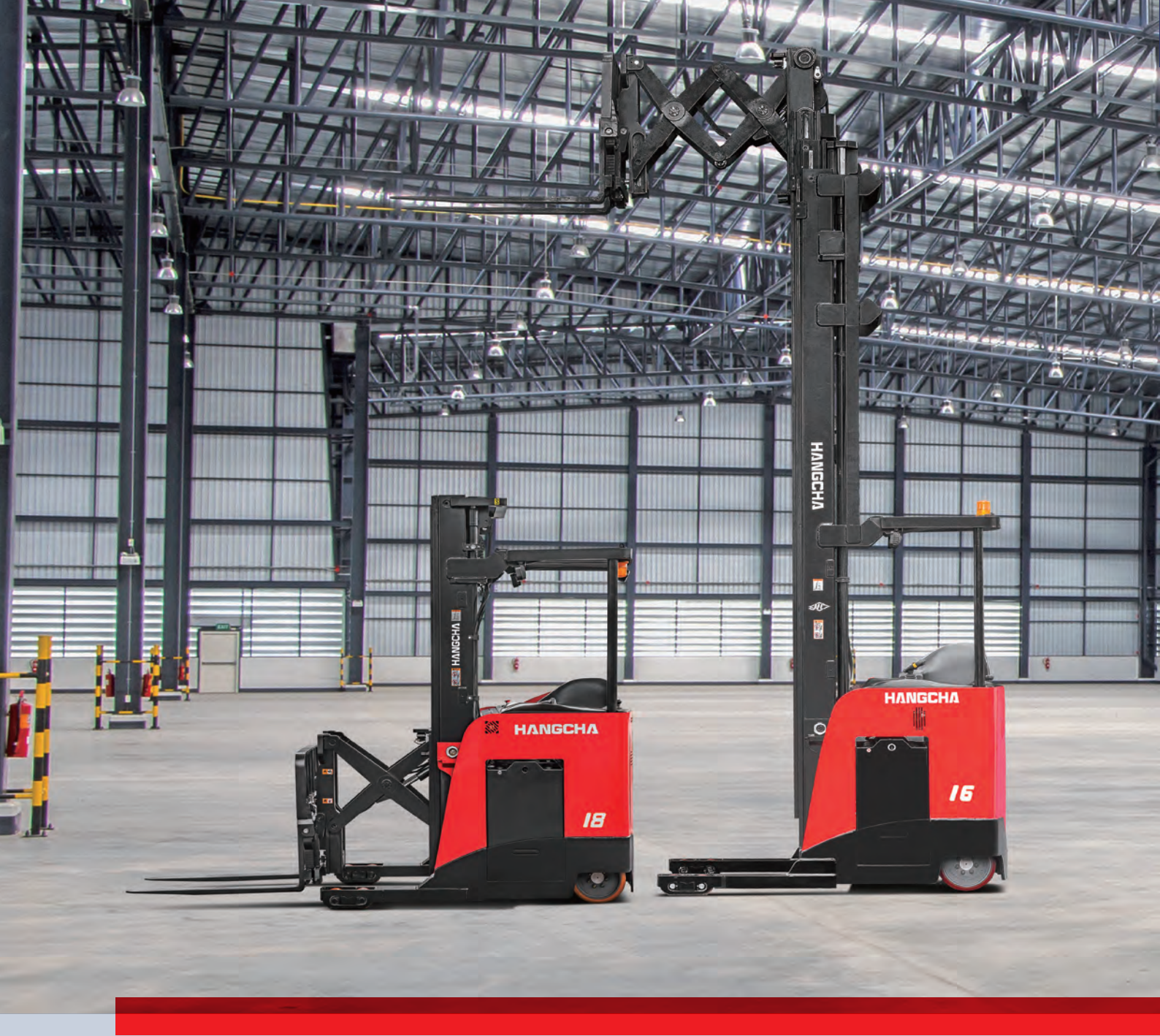
A Series Electric Stock Picker 1,000lb Load Capacity