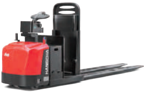
A Series Walkie Straddle Stacker 2,500lb Load Capacity