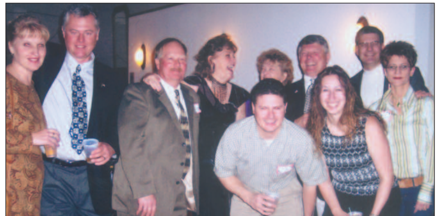
2005 Annual Party