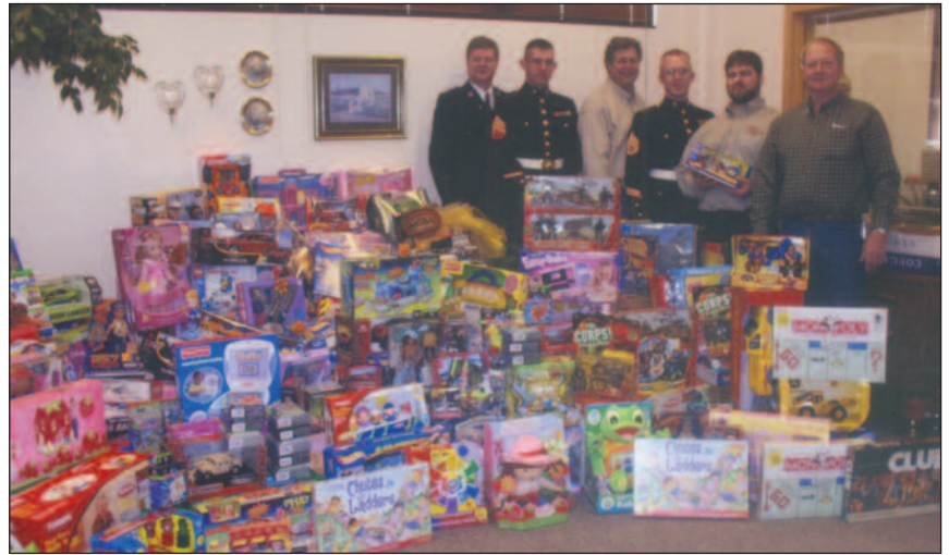
Toys for Tots