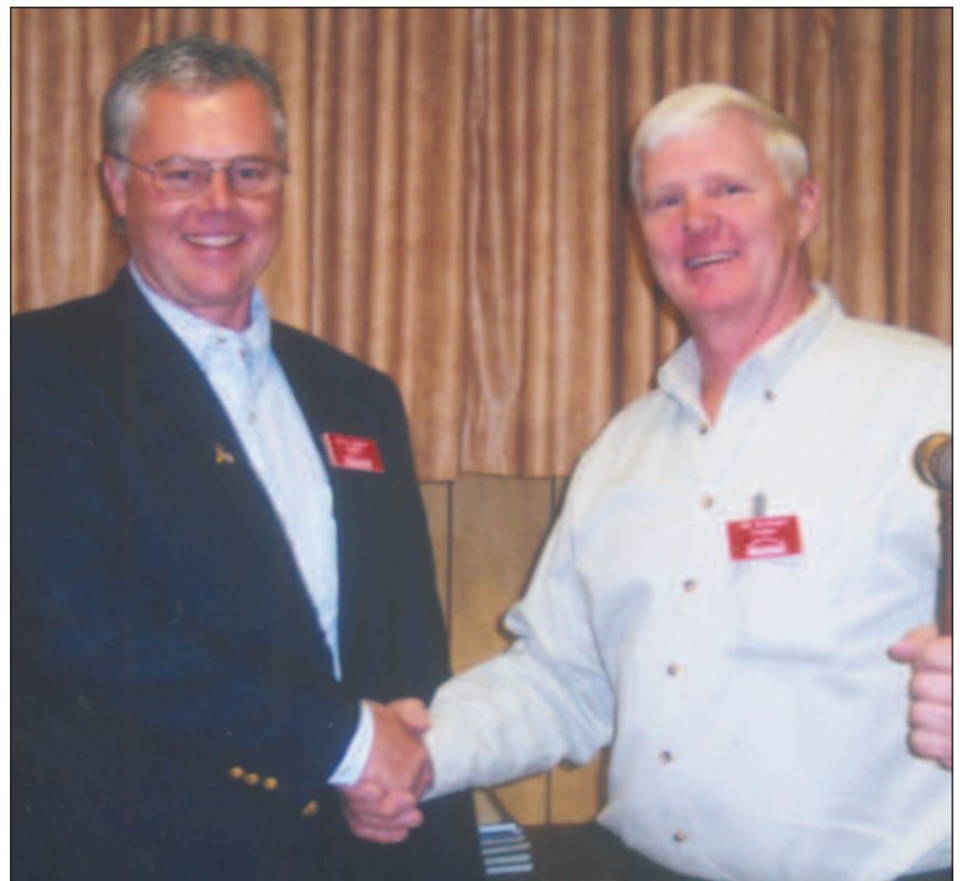
2006 Membership Dinner Meeting