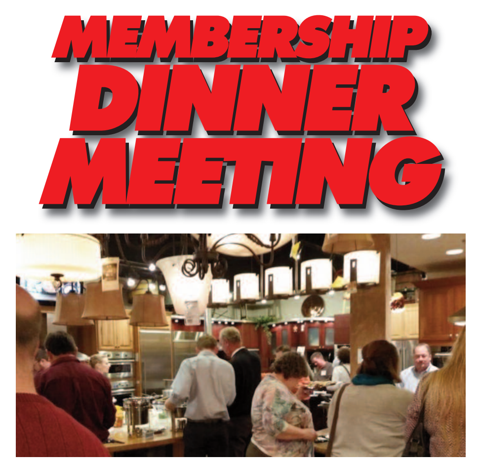
We will have elections of officers. Please come to vote on president, vice president, treasurer and 3 directors.

Explore the industry's largest exhibit floor to meet one-on-one with more than 1,300 top suppliers – approximately 25% new to IBS, see the latest products and services and get your questions answered. For more information go to: www.buildershow.com