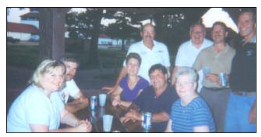
2003 Annual Picnic