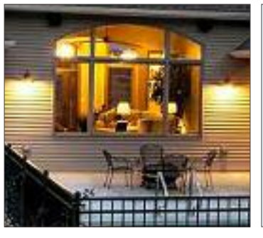
All members have access to a free building code hot line regarding building regulations and inspections.

Housing is a huge part of Wisconsin's economy. Every 1,000 new homes creates 3,000 full-time, permanent jobs, $117 million in income and over $15 million in state and local taxes.