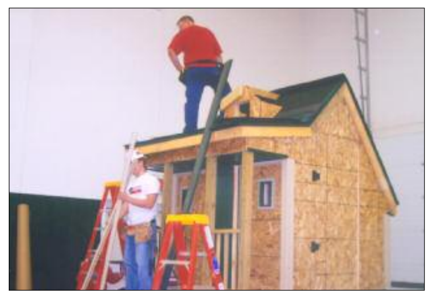
2007 Home Show