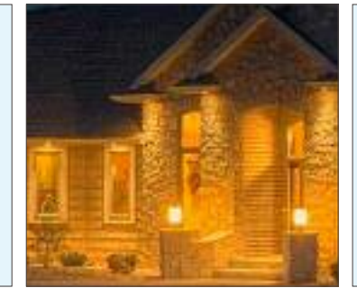
WBA put an end to a $780-per acre "farmland conversion fee" paid by developers.

In just the last two years, WBA lobbying has saved the industry more than $400 million.