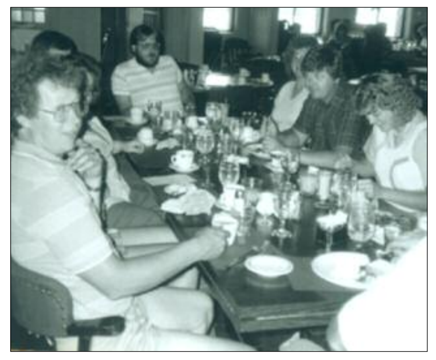
1986 Brewing Outing