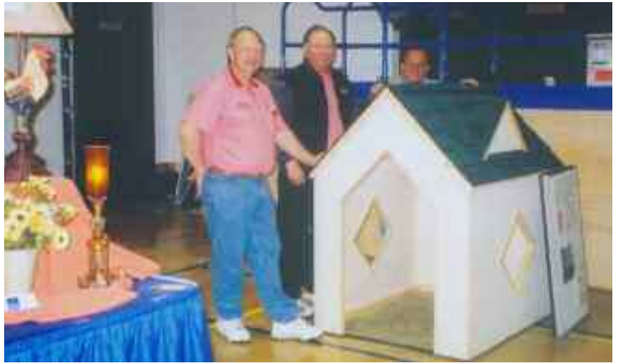
2004 Home Show