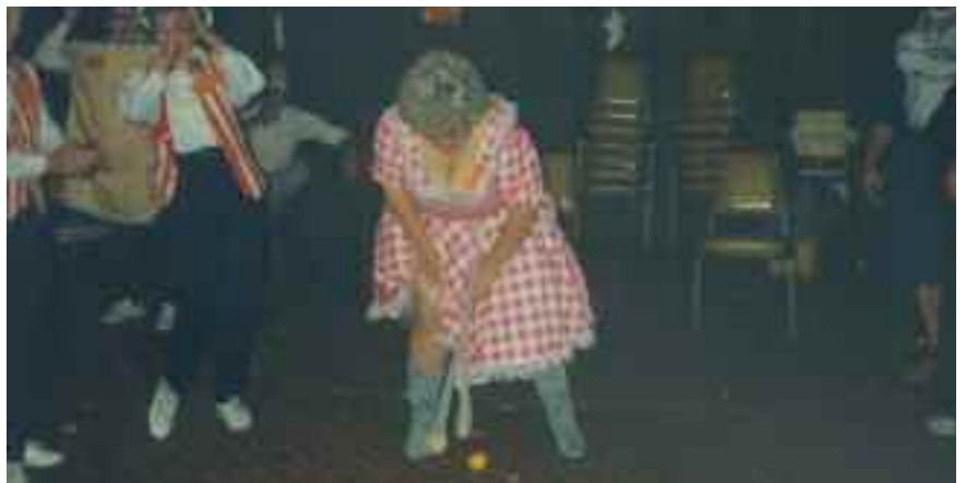
1988 Halloween Party