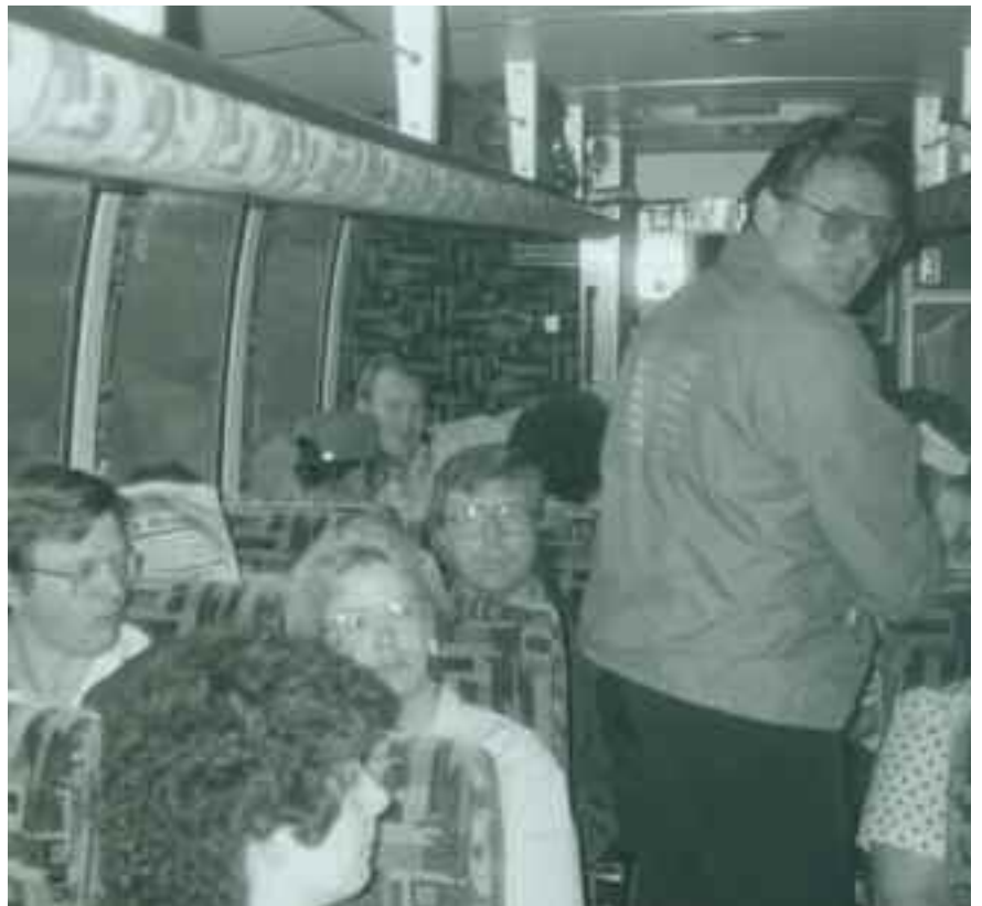
1986 Brewer Outing