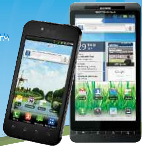
LG Ignite™ / Motorola Milestone X2™

Nationwide Coverage, Devices and Plans Personalized for the Way You Live.