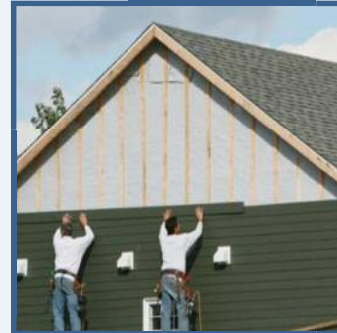
Vinyl Siding Recycling

Recycling Saves You Over 40% Landfill Disposal = $43/ton Recycling* = $25/ton Loads must be source-separated and contain no garbage