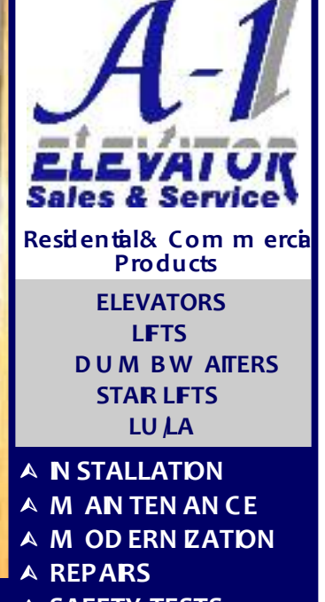
w w w A1Eevatorbiz