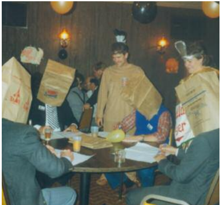
1987 Halloween Party