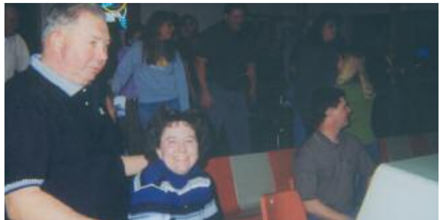
2003 Bowling Outing