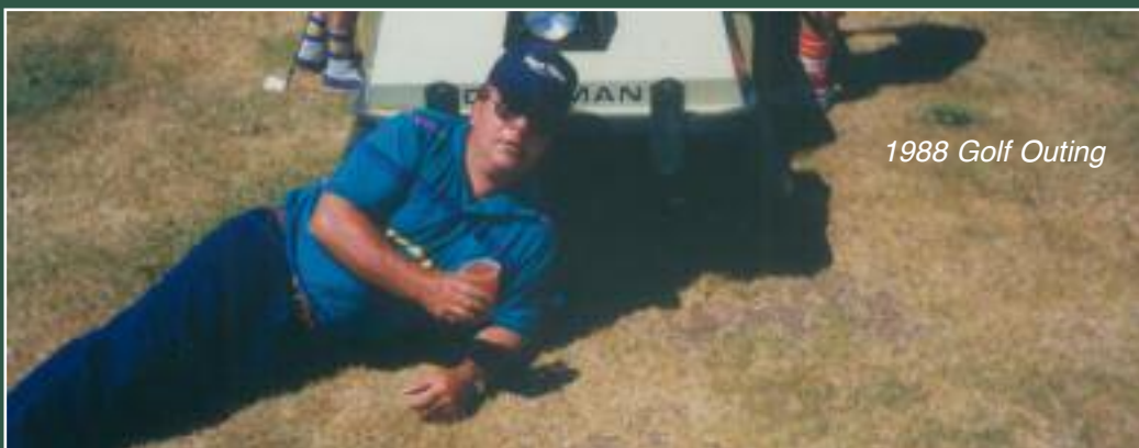
1988 Golf Outing