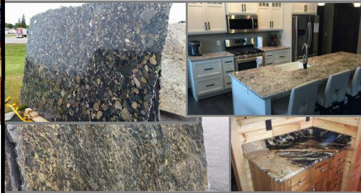
Our On-Site Granite Fabrication Shop will Create the countertop of your dreams! STOP IN AND SEE US TODAY FOR A FREE ESTIMATE!

From our On-Site Stone Yard to Your Home! We can simplify your Granite Experience!