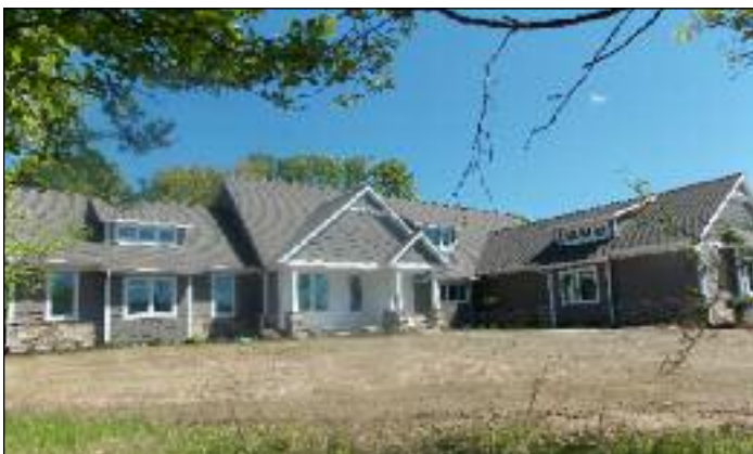
JEREMY VOIGT CONSTRUCTION CO., LLC