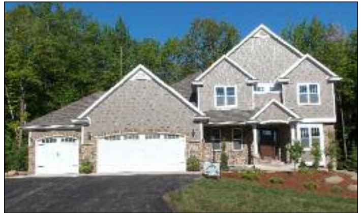
CHAD SICKLER CONSTRUCTION LLC