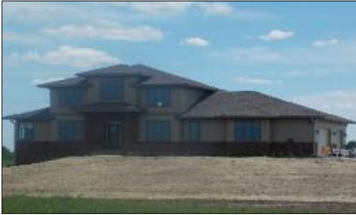
JEREMY VOIGT CONSTRUCTION CO., LLC