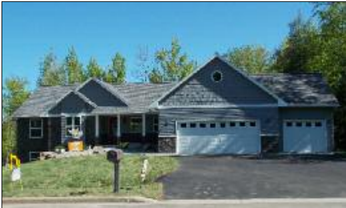
REEDY BUILDERS LLC