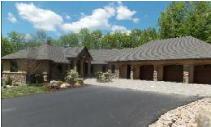
SORENSEN CONSTRUCTION LLC