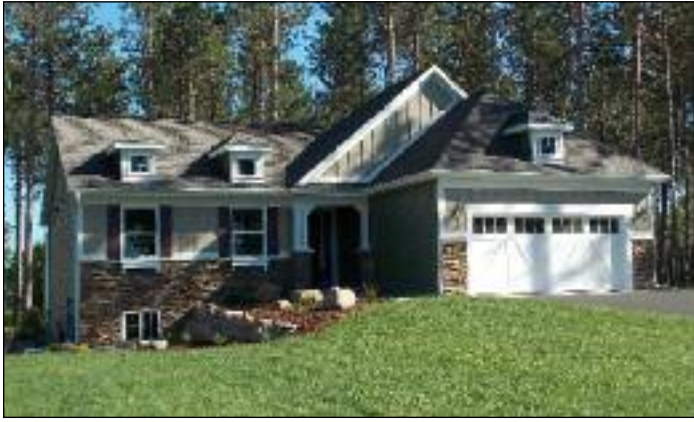
WAUSAU HOMES OF WAUSAU