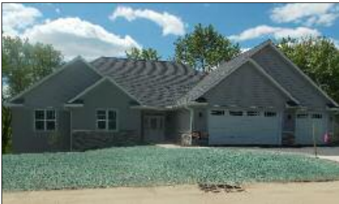
ROYALTY CUSTOM HOMES