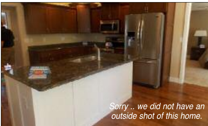
FORESIGHT CUSTOM HOMES, LLC