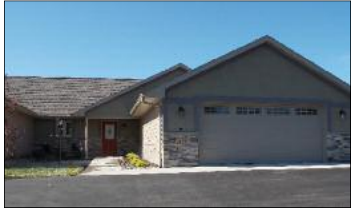
JOHN OHRMUNDT CONSTRUCTION INC.