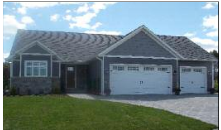
VISTAS AT GREENWOOD HILLS