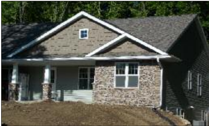
MAIN STREET HOMES, INC.