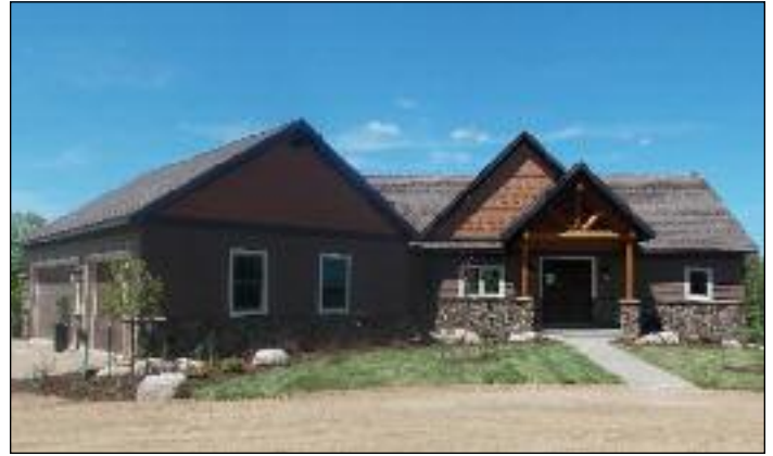
PRIME DESIGN CONSTRUCTION LLC