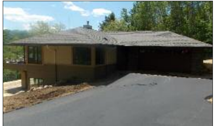
SORENSEN CONSTRUCTION LLC