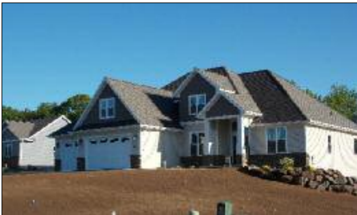
TRIM CRAFTERS LLC