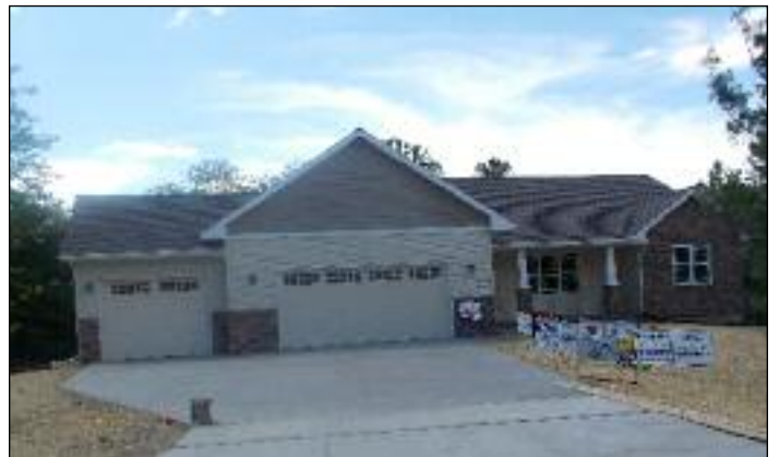
MAIN STREET HOMES INC.