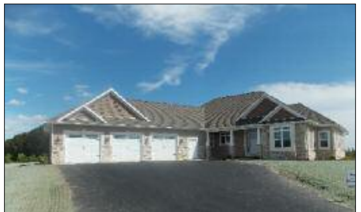
ROYALTY CUSTOM HOMES