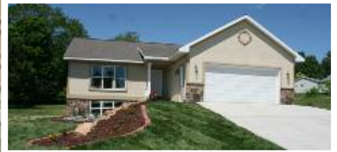
John Ohrmundt Construction Inc.