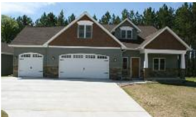
Trim Crafters LLC