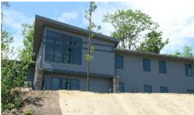
Sorensen Construction LLC