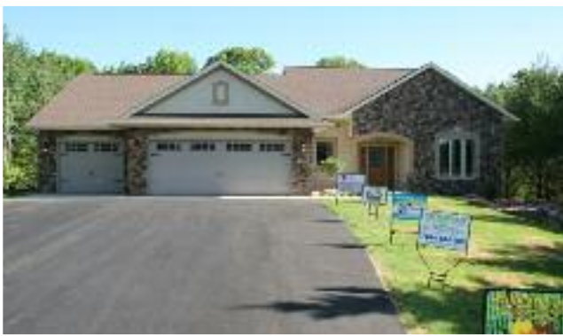
Kolby Construction LLC