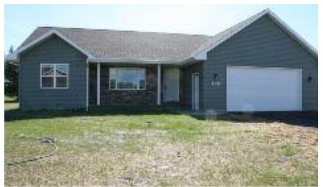
Main Street Homes, Inc.