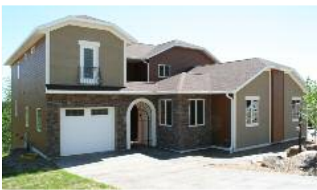
Sorensen Construction LLC