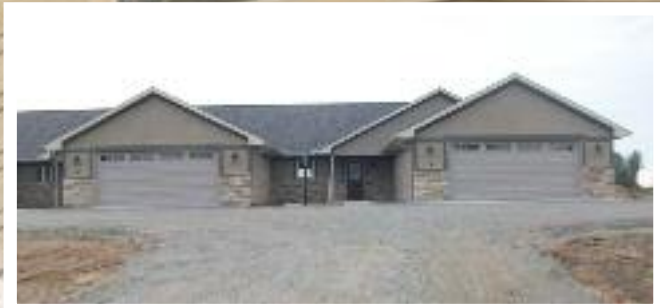
Main Street Homes, Inc.