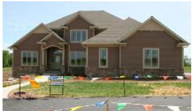
Jeremy Voigt Construction Co LLC