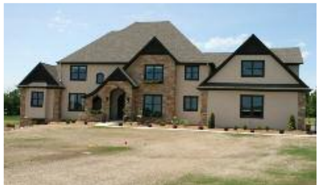
Jeremy Voigt Construction Co LLC