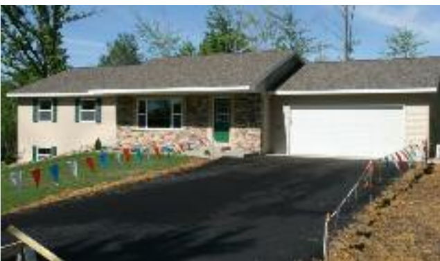
Reedy Builders LLC