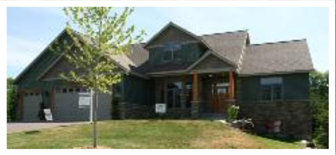
Brown Builders Inc.