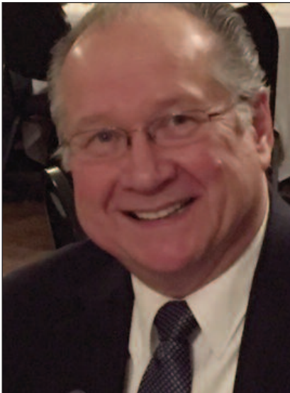
State Senator, Jerry Petrowski