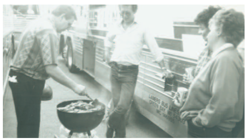
1986 Green Bay Packer Outing