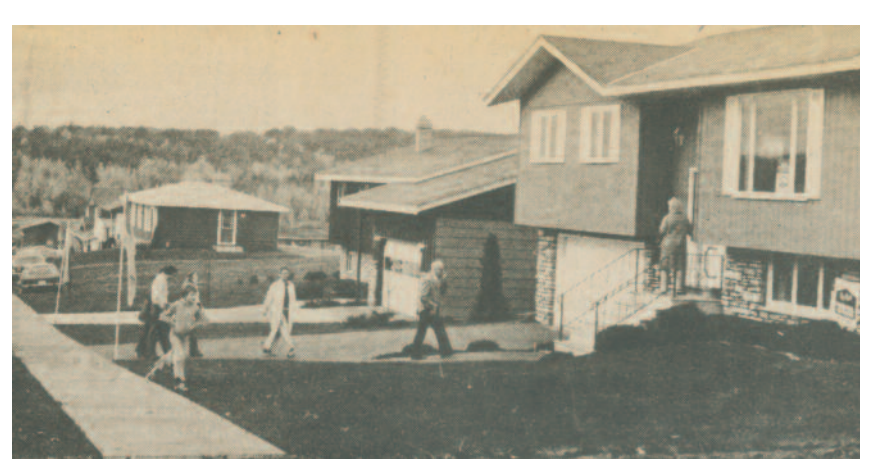
1975 Parade of Homes