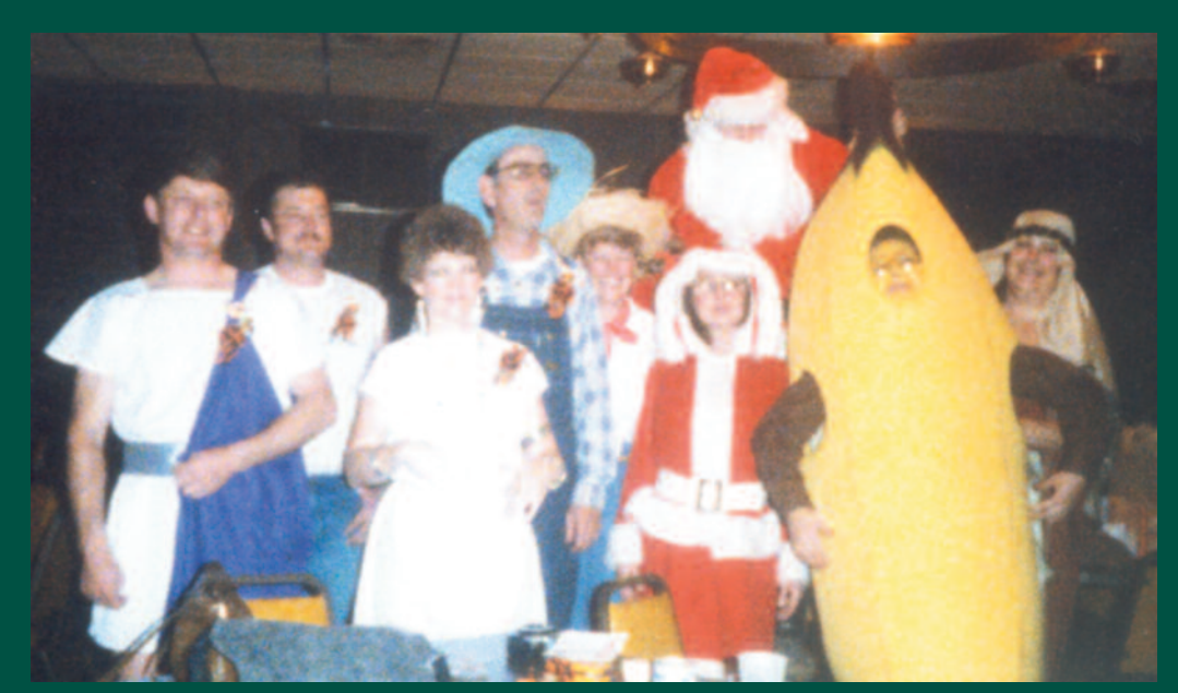
1985 Halloween Party