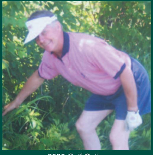
2006 Golf Outing