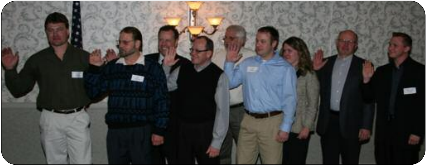
Board members being sworn in.