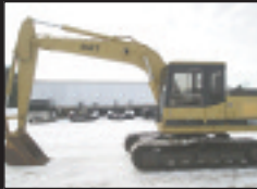
'89 Cat E120B, A.C., Cab, 36" Bkt, 28,000 lb. $17,500