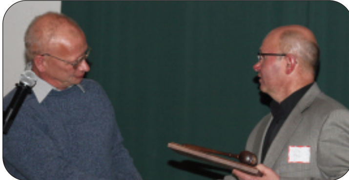
Passing of the Gavel