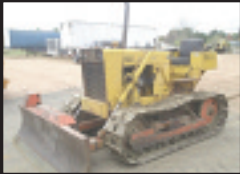
Case 350, 6 Way, Power Shift, New pins and buchings, 9,000 lb. Good Working Machine ! $8,900