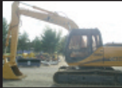
'06 Case CX130, A.C., Cab, 36" Bkt., 1,580 Hrs., 28,000 lb. $47,500

1425 O'Keefe Dr., Mosinee, WI 54455 • Email: hmsales@mtc.net • www.heavymachinerysales.com Phone: 715-693-7250 • Fax: 715-693-6481 • Cell: 715-571-1049