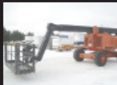
'01 Snorkel AB60J, Dual Fuel, 4x4, 60' Jib, 8' Basket, Art. Boom, 1,728 Hrs. VG Cond $12,500