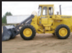
'92 Michigan L70, AC. Tool Carrier. 2,25 Yd. Hyd. Q.C. Bkt.. $22,500 Forks Available