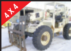
'98 Ingersoll Rand VR60B, Dsl, 4x4, 6,000 lb. 36", Q.T. Bkt and Forks. Low Hrs. $14,500