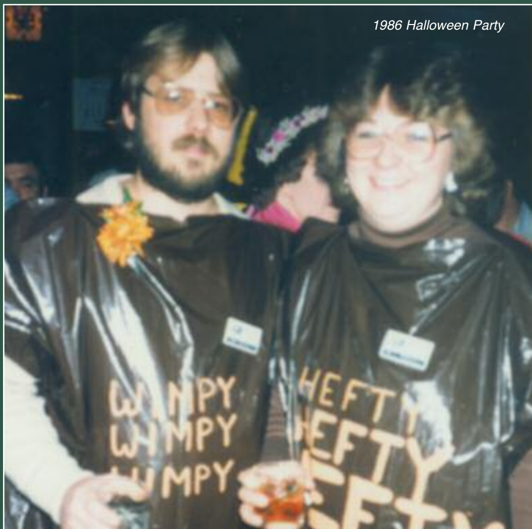
1986 Halloween Party