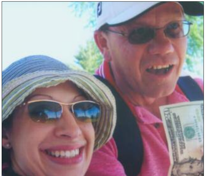
2005 Golf Outing