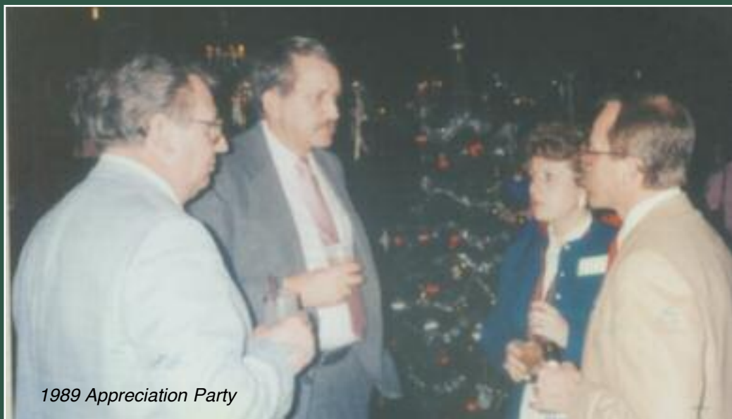
1989 Appreciation Party