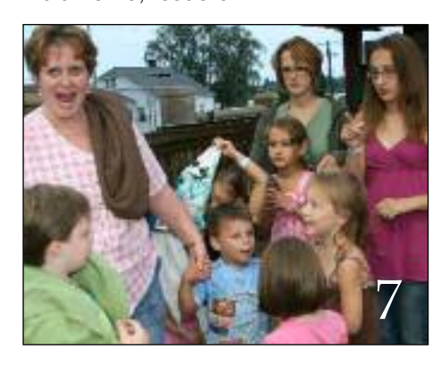
August 2010 Volume 29, Issue 8