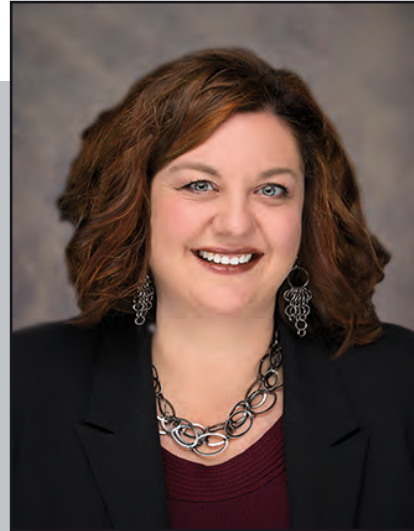
Amber Gober Peoples State Bank