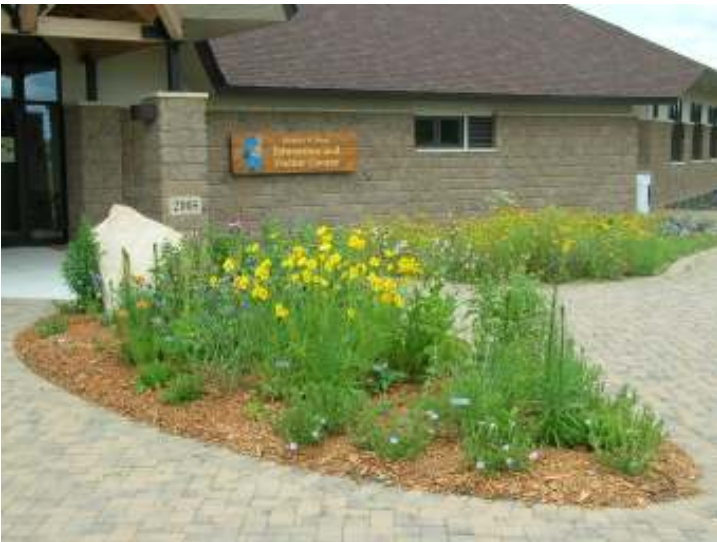
Prairie Garden in bloom at the entrance to the Stanton W. Mead Education and Visitor Center.

The Friends have grown ten-fold over the past few years. We hope to retain every current member and attract many more in the year to come. Thank you for your support of the Friends and of the Mead!