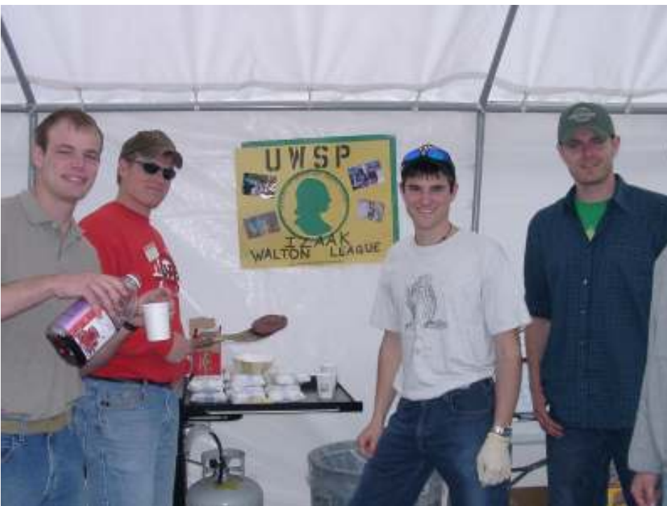
Members of the student chapter of the UWSP Izaak Walton League serve food and beverages for guests at the 1st Annual Prairie Chicken Festival held at the Mead Wildlife Area.