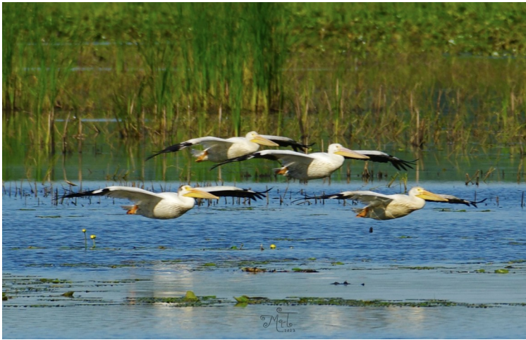
Pelicans in Flight