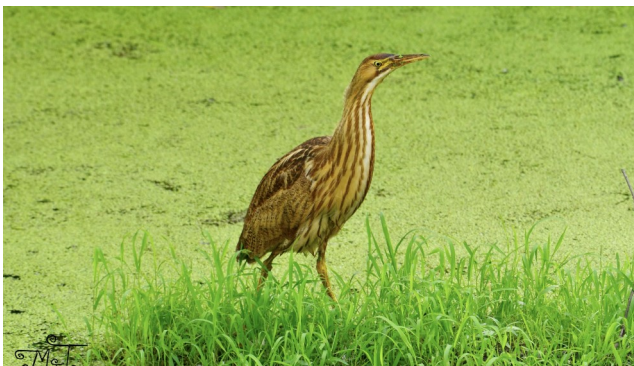
American Bittern

Lastly, I'd like to thank you, Friends of Mead and McMillan Wildlife Areas, for your continued support. Through your generosity and the tireless effort of many volunteers, several projects have been recently completed with more underway. If you're out walking around Dragonfly Pond, you may notice the education storage shed, which was designed and built by the Special Projects Team with a little help from the DNR roaming LTE crew. In the classroom, a new TV was installed to support a variety of education programming opportunities. As far as projects underway, a new boardwalk for McMillan is prefabricated and awaiting installation as well as a second snowshoe rack to hold the recently expanded snowshoe fleet.