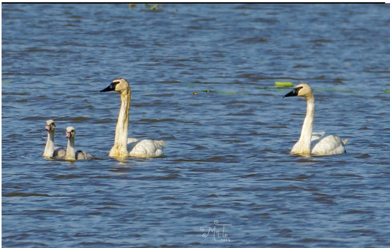
Trumpeter Swans With Signets