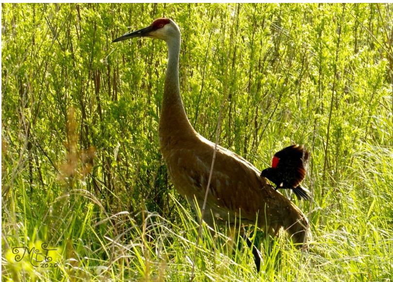
Red-winged Blackbird...Get off my back!