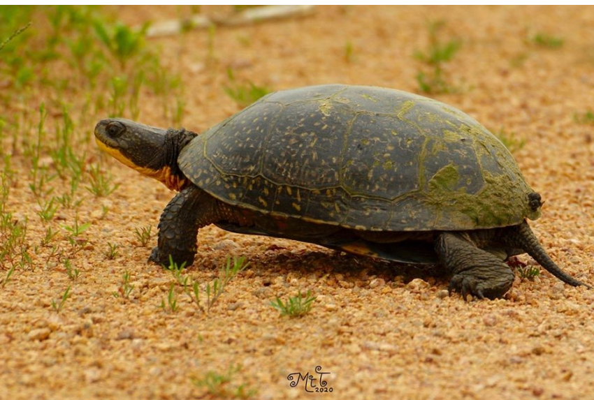
Blandings turtle by Marguerite Timmerman.

Blanding's turtles are threatened and I have had the good fortune to see one in the Mead Wildlife Refuge the last several years. Blanding's turtles prefer shallow marshy habitats with abundant submerged vegetation, although they can be found in almost any aquatic habitat. They are semi-terrestrial and often move between wetlands during the active season.