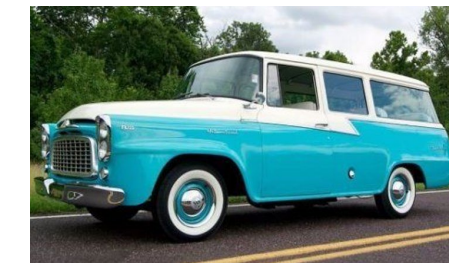
A: 1960 International Travelall