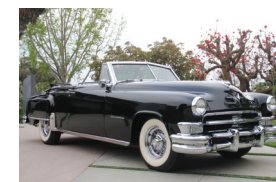
Chrysler Imperial 1951

What was the first car to have power steering?