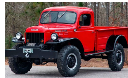
A: Dodge Power Wagon