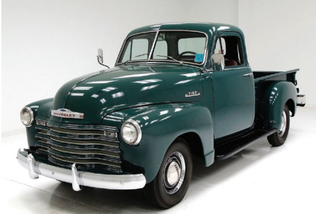
A: CHEVROLET 3100