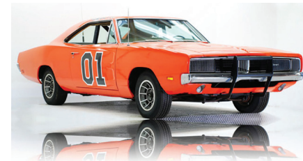
A: Dodge Charger