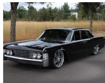
A: 1965 Lincoln Continental