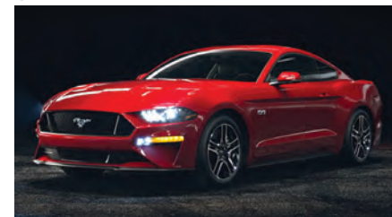
A: WWII Fighter Plane