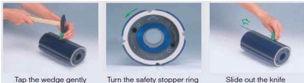
Tap the wedge gently