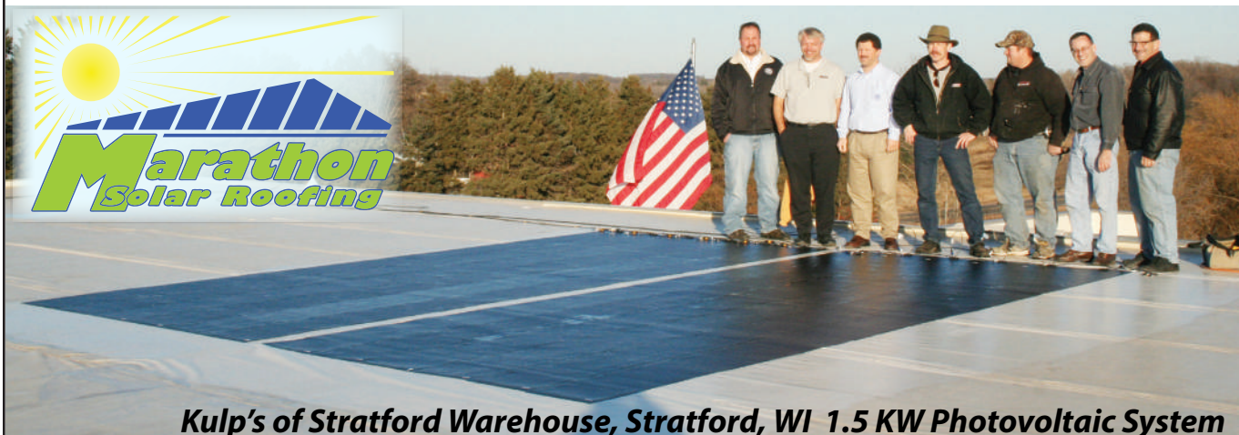
Kulp's of Stratford Warehouse, Stratford, WI 1.5 KW Photovoltaic System

Ask for a site assessment and a Return On Investment specific to your building and site.