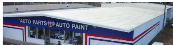
Car Quest, Schofield, 17,000 sf