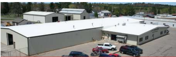
Dept. of Public Works, Rhinelander, 35,000 sf