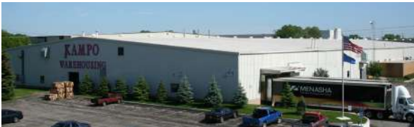
Kampo Warehousing, Appleton, 91,000 sf