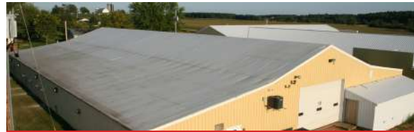
Wolfcraft, Unity 18,000 sf