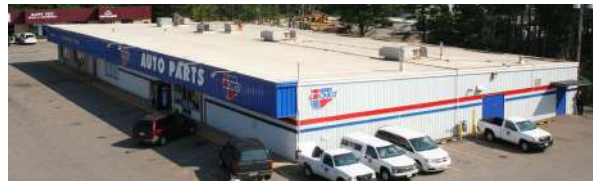
CarQuest, Stevens Point, 20,000 sf