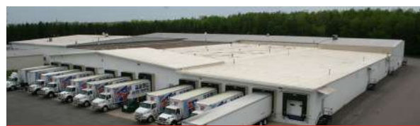
Car Quest Warehouse, Marshfield, 41,00 sf