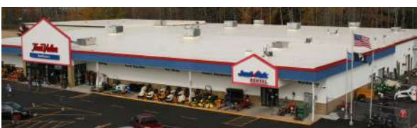
Qualheim's True Value, Shawano, 56,000 sf