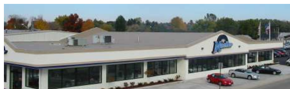
Fred Mueller Buick, Schofield 41,000 sf