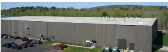
Linetec, Wausau, 57,000 sf