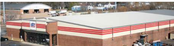
Probuild, Wausau, 32,000 sf