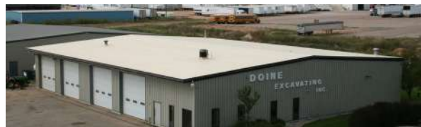
Doine Excavating, Marshfield, 8,400 sf