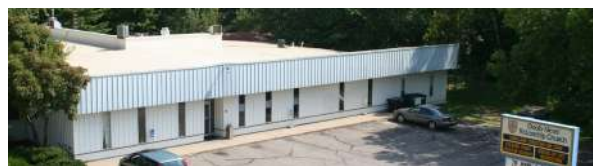
Good News Fellowship, Stevens Point, 10,000 sf