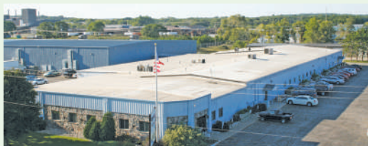
Journal Community Publishing, Waupaca 35,000 sf

With federal tax credits, state incentives, and accelerated depreciation schedules, now may be the right time to have a "hedge" against future energy price increases and make a statement about your company's commitment to "green" energy!