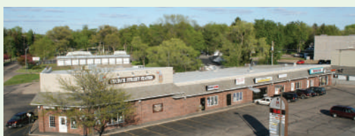
Church Street Station, Stevens Point 15,000 sf

Kulp's of Stratford has been installing metal roof retrofits for over 25 years with 99% of the roofs still in service.