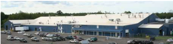
Amron Corporation, Antigo, 85,000 sf