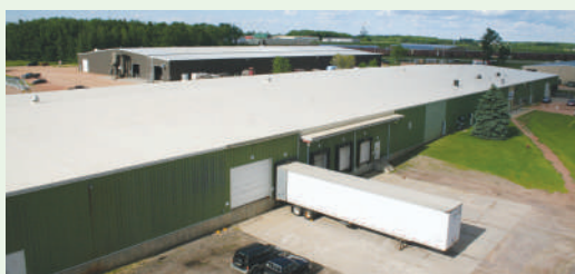
Buffets 74,000 sf