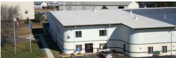
Weston Municipal Building, Weston, 17,000 sf