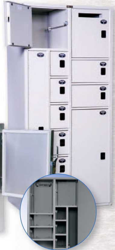
Pass-Thru Unit as seen from rear

Our evidence lockers consist of modules that can be configured in a wide array of layouts. Visit our website to find out more!