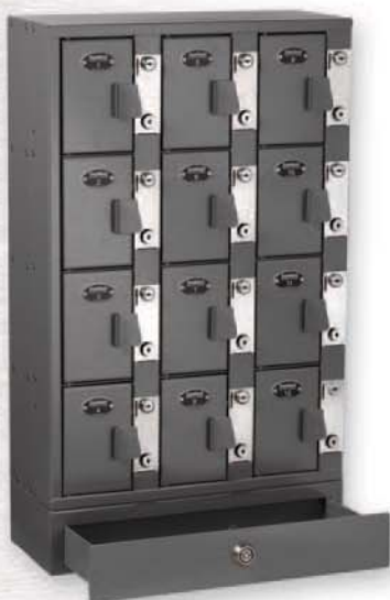
shown with optional cash box

Manufactured of 16 gauge steel, these lockers provide storage for small items such as cell phones or PDA's that are not permitted in federal buildings, courthouses, etc.