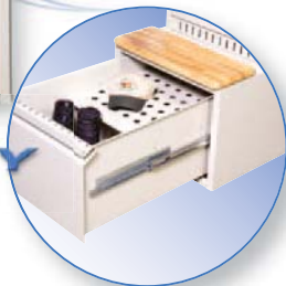
Drawer features a removable, ventilated body armor tray