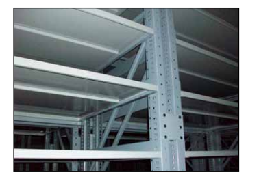
Low Profile Shelves No overlapping, shelves slide straight in.

Borroughs Technical Support team is the most experienced in the industry, and expertly guides each project from design to install.