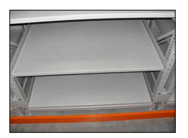
Guardrail for Mechanical Guidance System and shelving protection.