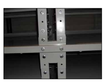
Face Plate and Down-Aisle Support Tube with engineered connection to post.

is fully welded and consists of post, horizontal and diagonal supports. All components are 14 gauge, the lower frame includes welded footplates. Frames are vertically connected using a tried and proven splicing system. Horizontal units are connected with face plates for added structural integrity.