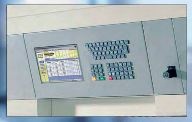
The Hänel MP 12 N-S top controller with touchscreen technology