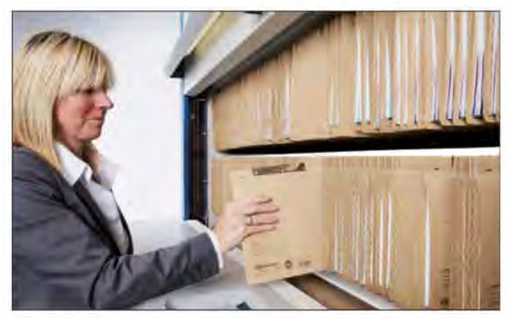
The right file is found among thousands of hanging folders in seconds

Tailored management and control systems plus interfaces with PC workstations make the Hänel Rotomat<sup>®</sup> the ideal partner in commercial and administrative offices.