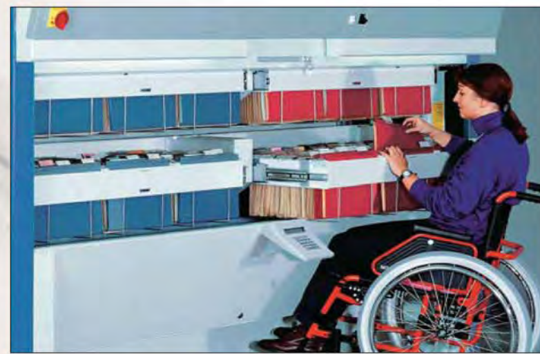
The Hänel Rotomat® 600 for vertical hanging folders in the version adapted for the disabled – ideal for wheelchair users