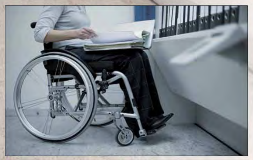
The ergonomically-designed foot recess at the retrieval point allows wheelchair users to approach the carousel closely