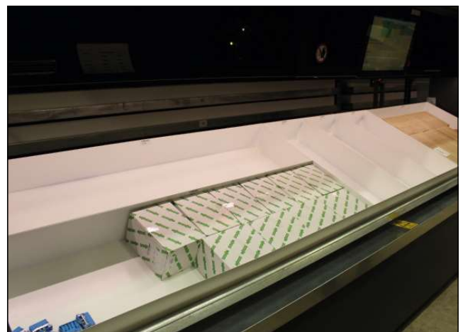
Optional tilt function reduces reach depth and provides an ergonomic working position