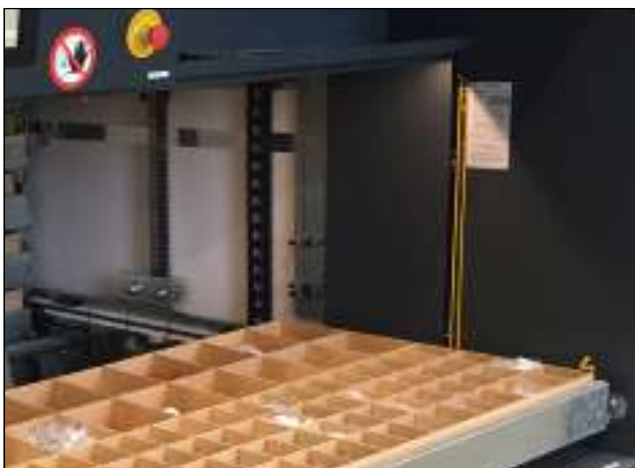
The shifted light curtain means safe order picking

ClassicMat™ frees up to 85% of your floor space when compared with conventional storage solutions and offers the market's most user-friendly and safe pick-opening, with a shifted lighting curtain. This VLM offers a huge benefit for both your business and your employees.