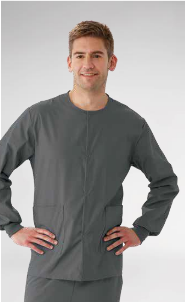
Style 849 Unisex snap front knit cuff 2-pocket jacket

● = No color-coded neck line CA = Angelica color-coded neck line CM = Medline color-coded neck line