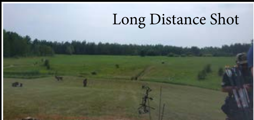
Long Distance Shot