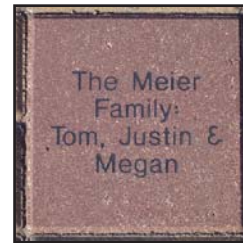
8" X 8" Brick