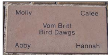
8" X 16" Brick