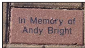
4" X 8" Brick