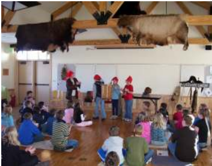
Students from Auburndale Elementary School.