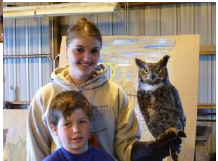
Visitors at the Prairie Chicken Festival.