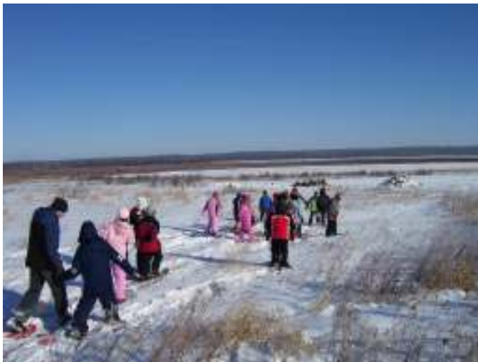
Students from Auburndale Elementary School.

Water levels are very high at present and many dikes on Mead and McMillan wildlife areas are under water. Muskrat holes are the main culprit for once the water gets high, water begins to run through them. When this happens it is very easy for the dike to wash away. We certainly do not want this to happen so we are watching everything very closely. With all the water though, we will be entering the summer with the best water conditions in years! Have a great spring and come out and all the wildlife that is so visible this time of year.