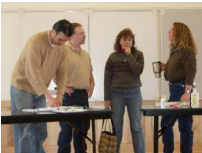
KEEP class participants.

As part of the class, each participant did a Peer teaching lesson for the class on the second Saturday. These Peer teaching activities were also given to all the participants for them to use in their classrooms. An individual project is also required to complete the requirements for the class.