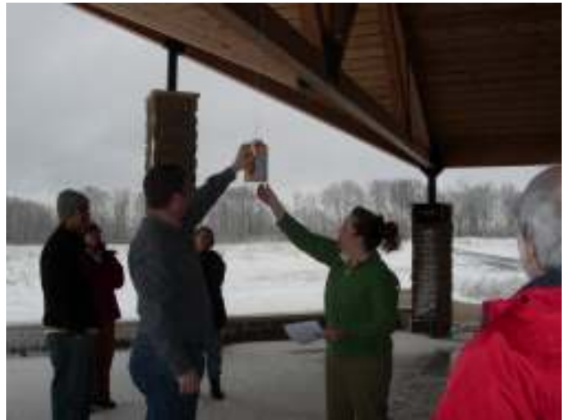
KEEP class participants partake in a demonstration.