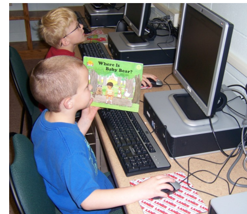
Students use Accelerated Reader to check reading comprehension.

At Trinity, technology is integrated into many subjects. Other than keyboarding and basic computer introduction, technology is not a stand alone class. Technology is used to improve instruction in core curriculum areas. Today technology is a tool of educational instruction much like books have been for many years.