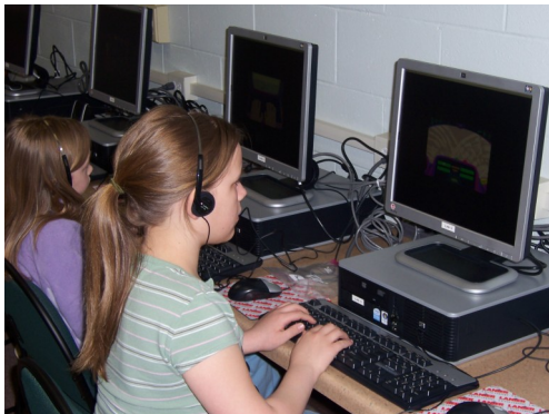
Students learn life skill of keyboarding using Type2Learn .

“Every good and perfect gift is from above...” James 1:17