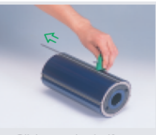
Slide out the knife