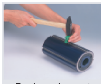
Tap the wedge gently