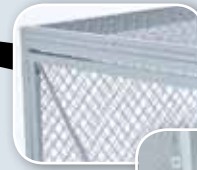
WIRE MESH CEILING