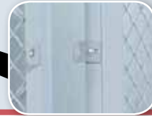
ADJUSTABLE PADLOCK HASP