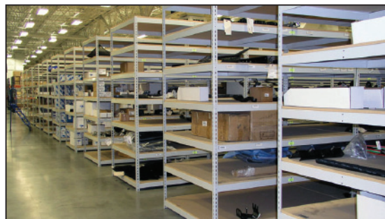
Runs of Rivet-Span® fill the second floor