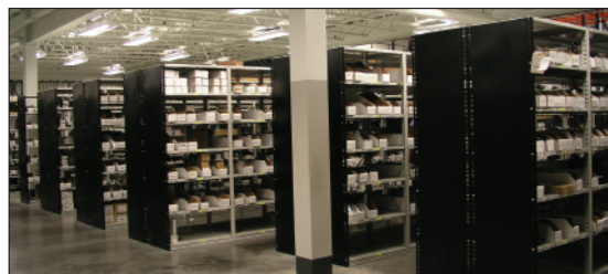
Box Edge Plus® storage for medium sized parts