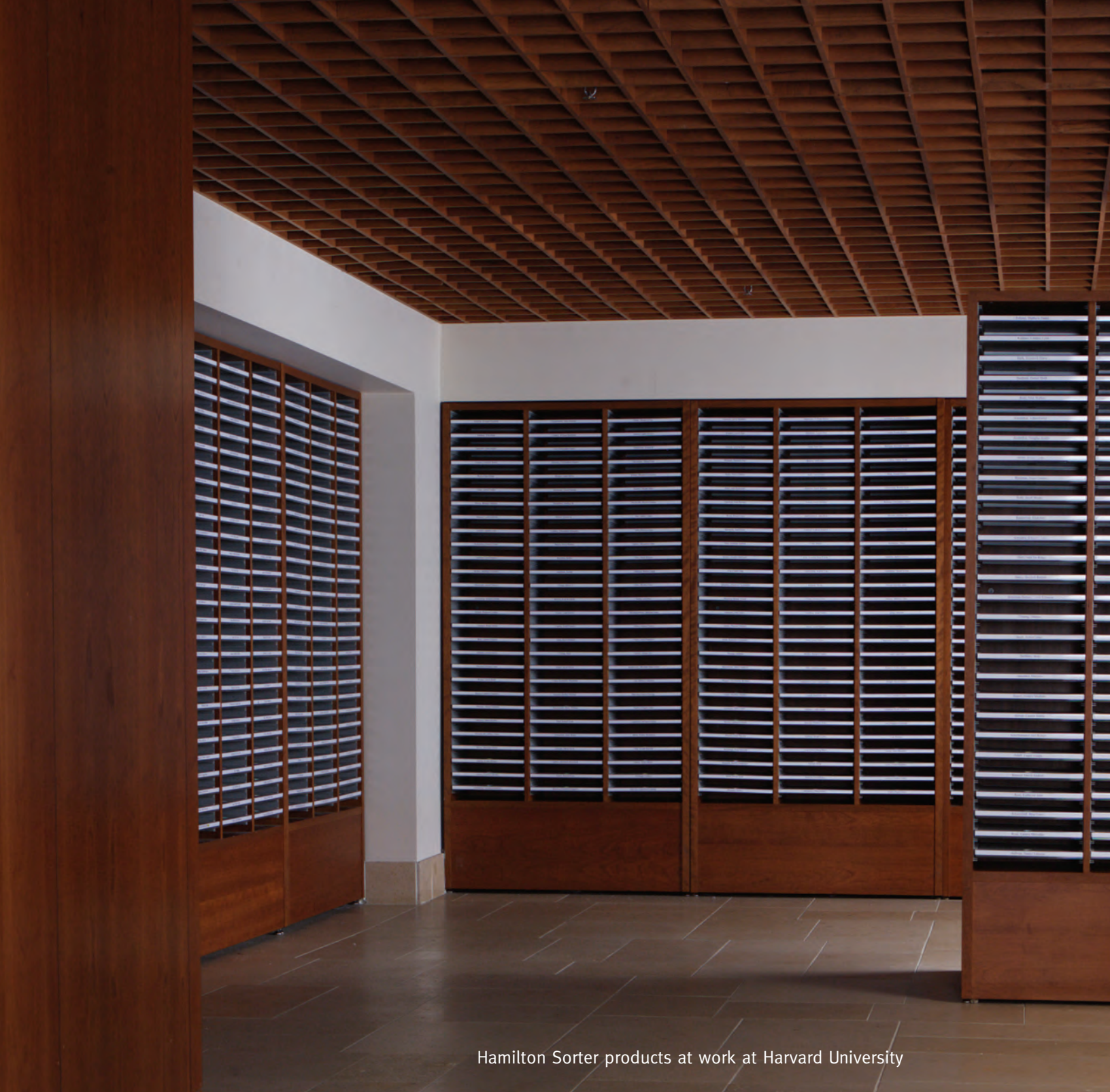
Hamilton Sorter products at work at Harvard University