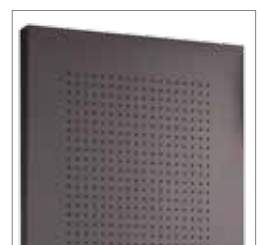
Perforated Panel (detail)