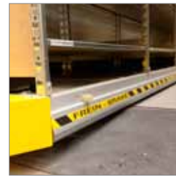
Mechanical Safety Brake

Please refer to www.montel.com for additional information.