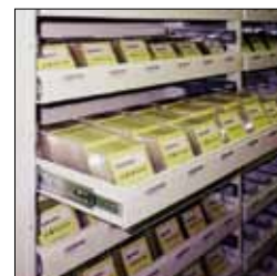
Pull-Out Media Drawers