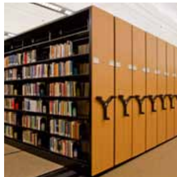
Duquesne University Gumberg Library