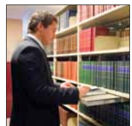
Pull-Out Reference Shelf