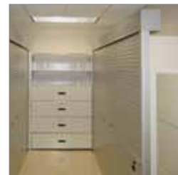
Lockable Rolling Shutter Doors