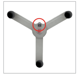
Handle with Locking Pin