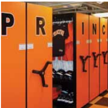
Princeton University Athletic Department