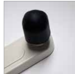
Soft-Touch Ergo Grip