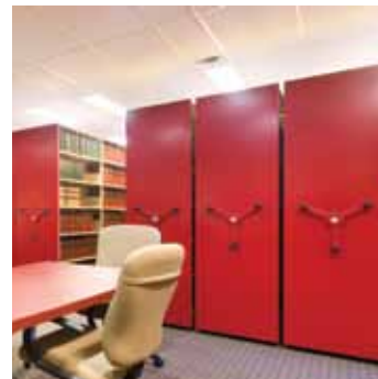
Autorité des Marchés Financiers