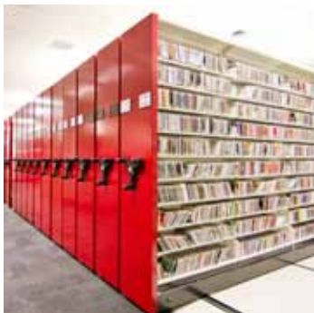
Canadian Broadcasting Corporation

Versatility and functionality. Mobilex® offers endless storage solutions for specific storage needs: archives, artifacts, athletic equipment, binders, blue prints, books, boxes, bulk storage, cabinets, files, film cans, golf bags, linens, media, office supplies, parts and pieces, police evidence, records, skis, specimens, tapes, tools, video tapes, weapons and x-rays. The list is endless.