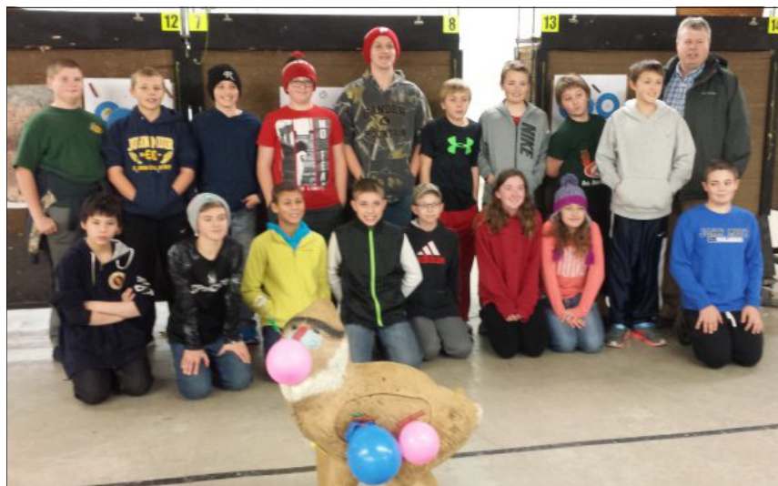
Here is the group with a date set for December 11, 2017, mark your calendar and volunteer.