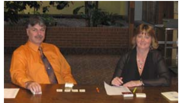
Our friendly check-in crew!