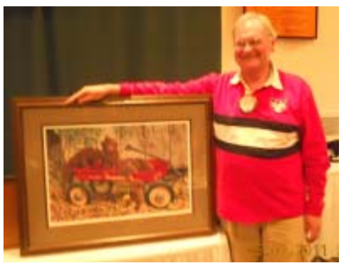
Monday, May 9, 2011 The Riverview Spinners were at the meeting to give us a demonstration!