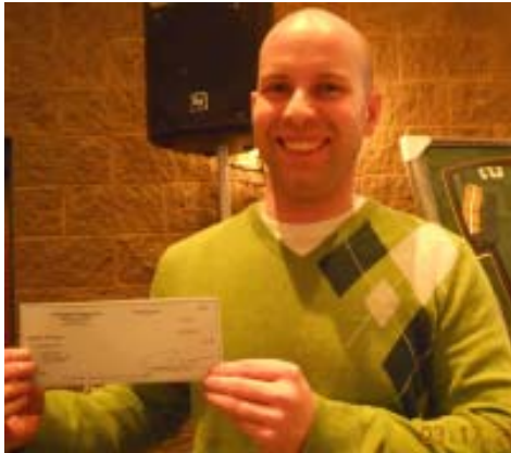
Big Bucks. No Whammies!