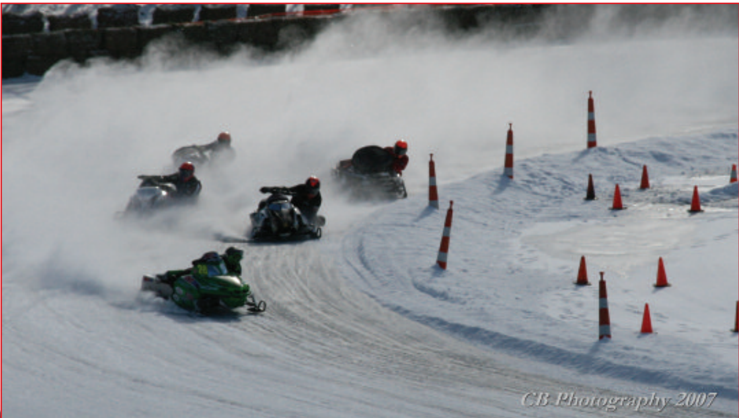
CB Photography 2007