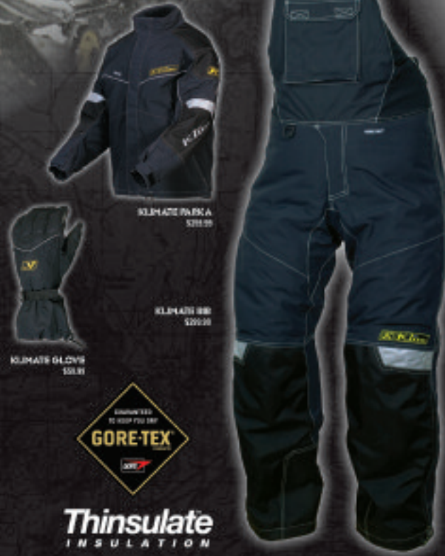
KLIMATE PARKA $289.99

Your time out riding is very valuable. Why risk ruining the experience by using gear that leaves you wet and uncomfortable? The all new Klimate Bib is the first technical insulated bib which uses GORE-TEX® product technology, the only technology on the market that carries the GUARANTEED TO KEEP YOU DRY® promise. Additionally, Thinsulate™ Insulation is added to the Klimate Bib to defend against the harsh cold encountered while riding. Ride with confidence and ride in comfort knowing that your experience is guaranteed.